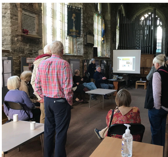
Volunteers attending a session about the new website